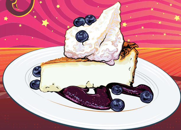
Blueberries & Cream Basque Cheesecake deeply caramelized with a creamy center, served with blueberry-brown butter sauce, whipped cream & fresh blueberries