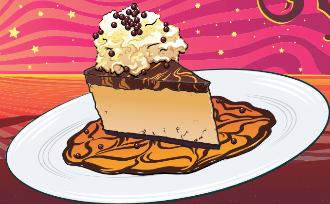
Hopscotch Peanut Butter Pie peanut butter mousse atop chocolate cookie crust, glazed with dark chocolate ganache, served with butterscotch & chocolate sauces, whipped cream & chocolate crisp pearls